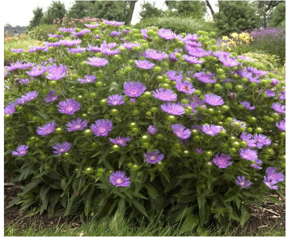
Stokes Aster (Spring/Summer)