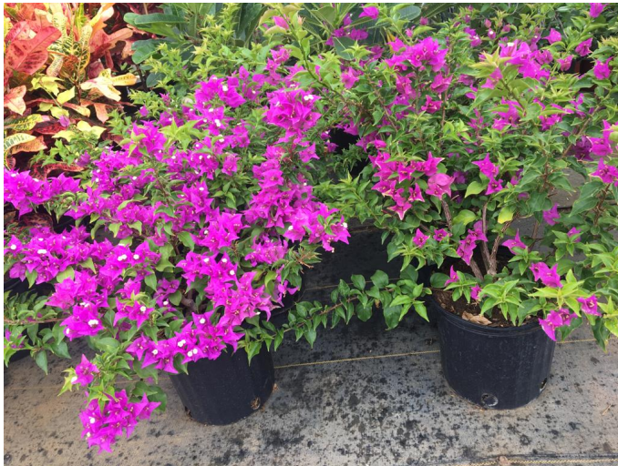
Dwarf Bougainvillea (year-round)