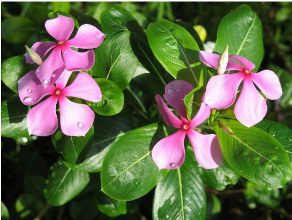
Impatiens (Pink/Red/White/Purple) (Spring/Summer)