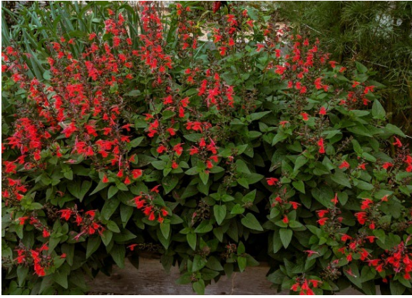
Tropical Sage (spring/Summer and Fall Winter)