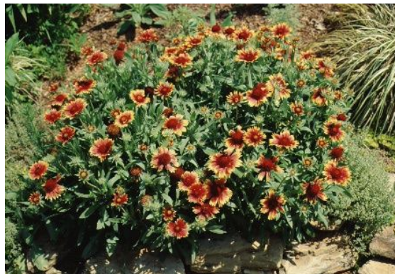
Blanket Flower (Fall/Winter)