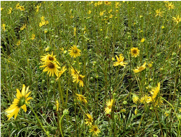
Lakeside Sunflower (Spring/Summer)