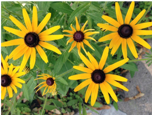
Blackeyed Susan (Spring/Summer)